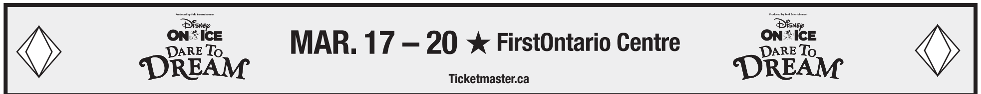
LEFT EXTENSION FOR EARS