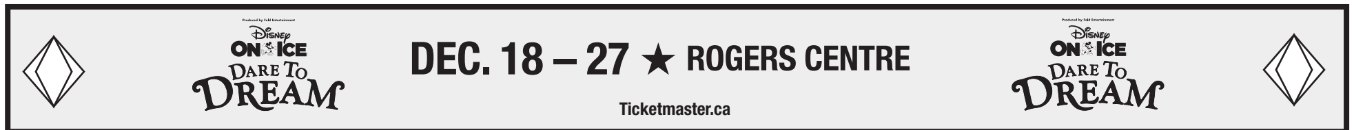
LEFT EXTENSION FOR EARS